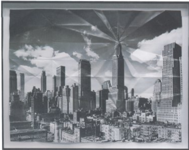
• Original (Color) (New York)