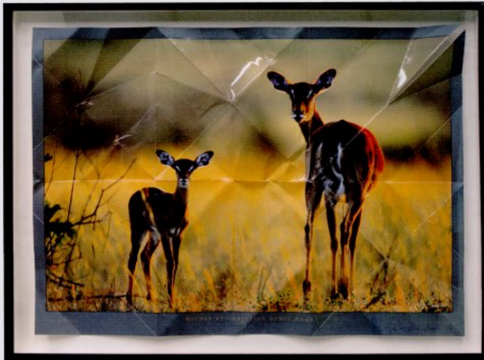
• Origami 'Tortue' (The Gazelles) 2003, Paper, 30x30cm