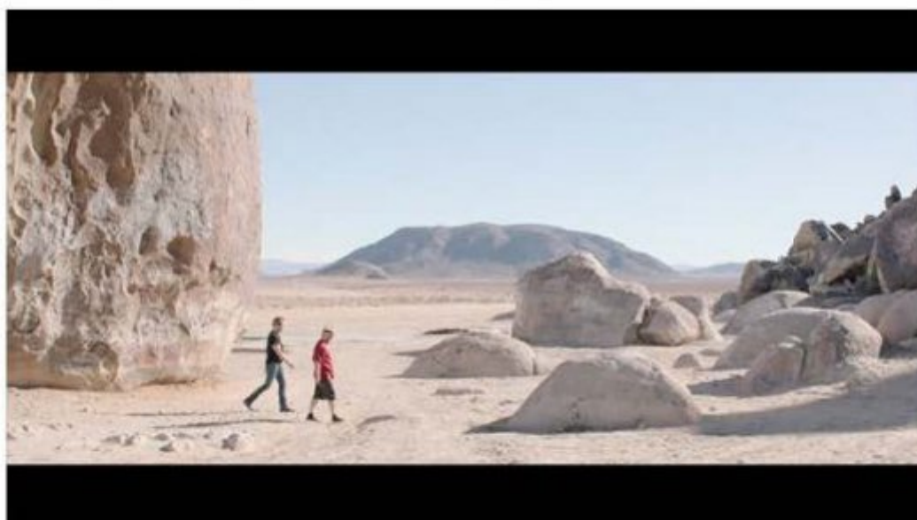
Pierre Bismuth , Where is Rocky II? , 2015.

Passionate about art? Click here to get our newsletter and follow your favorite artists