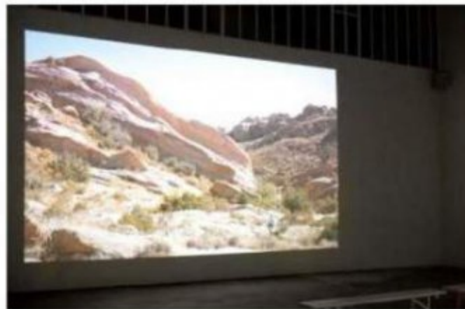
Pierre Blaridin, Where is Rocky II? , installation view, 2015.