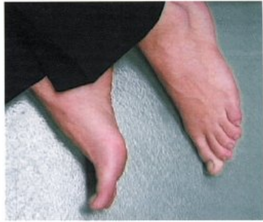
• D.E. 2003 / Video 061