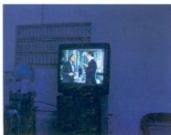
• Left: Link . Video is displayed, with original film projection.