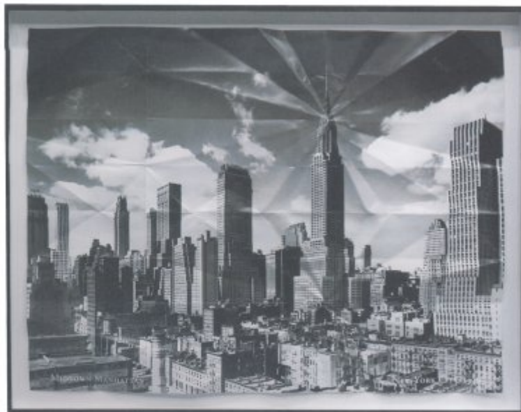
• Original (Color) (New York)