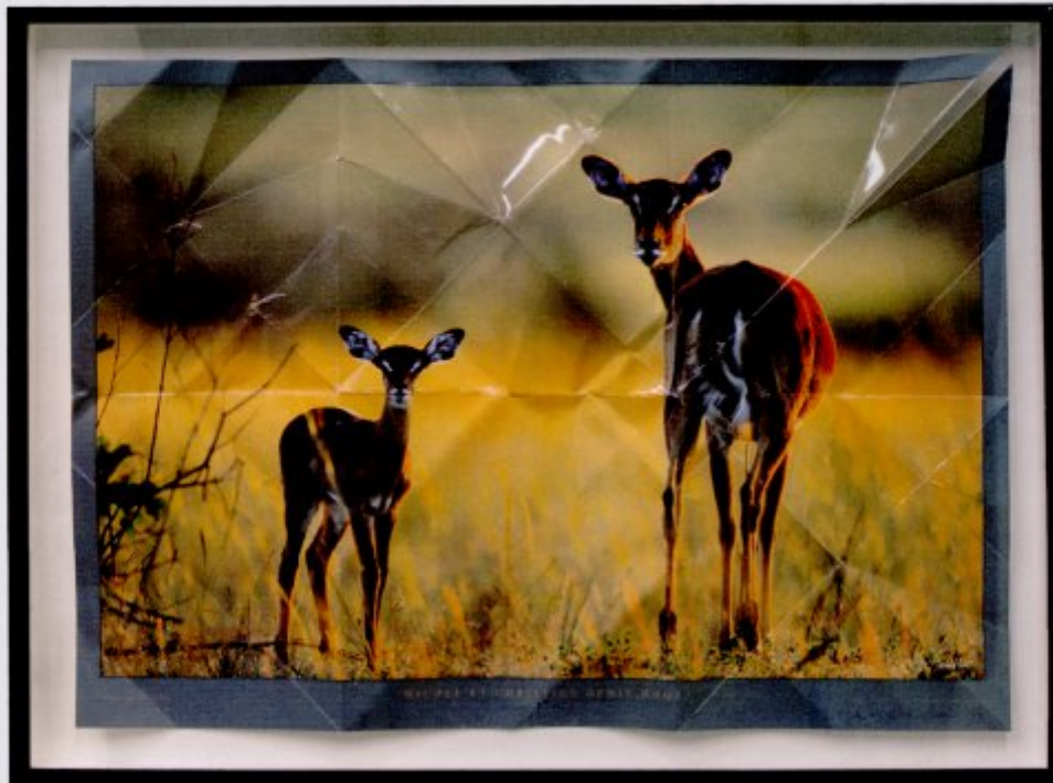
• Origami 'Tortue' (The Gazelles) 2003, Paper, Ink, Acrylic