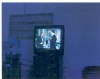
• Left: Link . Video is ongoing. With original Sleuth production.