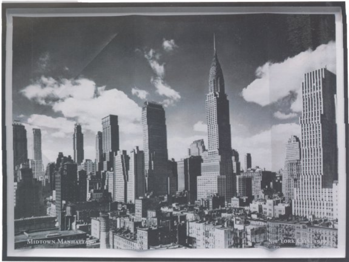
• Original Mount Fuji (New York)