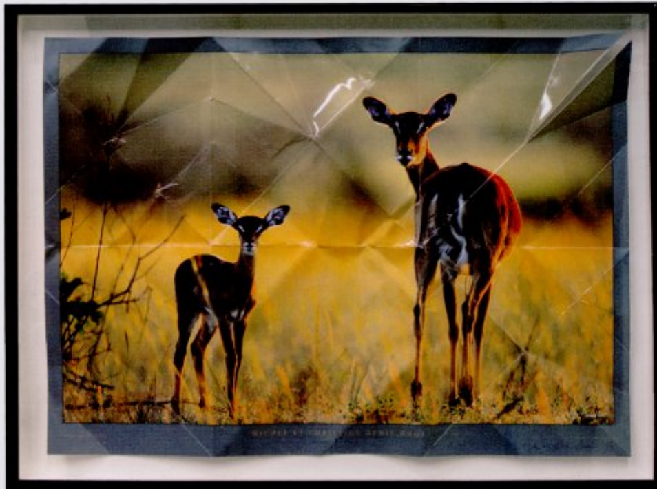
• Origami 'Tortue' (The Gazelles) 2003, Paper, Ink, Pencil