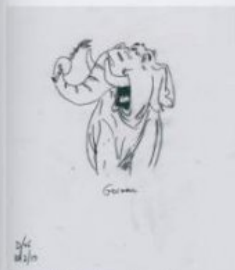
• The Jungle Book Project (Japanese) 2002. Drawing on tracing paper, 30 x 21 cm. The Jungle Book Project (German) 2002. Drawing on tracing paper, 30 x 21 cm.

piece: thus Shell and Mount Fuji (both 2003) title two old black and white posters of Manhattan, perhaps suggesting the paradoxical notion of the city as a new nature , or as a phenomenon equal with that of the greatest freak works of nature. Similar thinking informed the installation Some Things Less, Some Things More (2003), in which holes were cut from a partition wall and the circles arranged in an ambiguous, quasi-sculptural pile alongside.