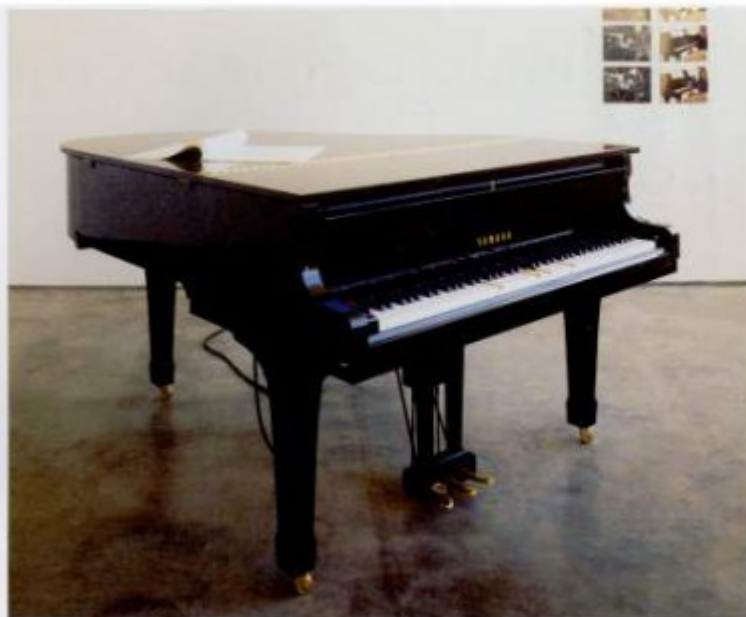
• Blue Monk in Progress 1995. Cello and piano musical score recorded April 1984 on disk, score bound with vinyl Pressed, 2000. Installation view.

Bismuth sees echo chambers built into the layout and the language of newspapers.