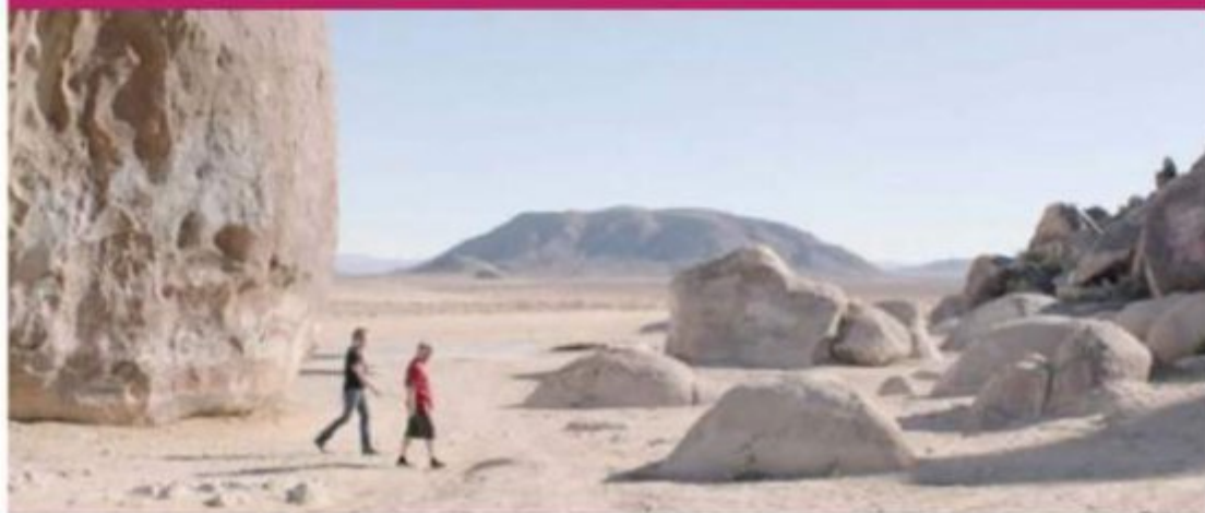
Screenwriters DK DeLoe and Anthony Focinon discuss storylines in the Mojave Desert, from Where is Rocky II?