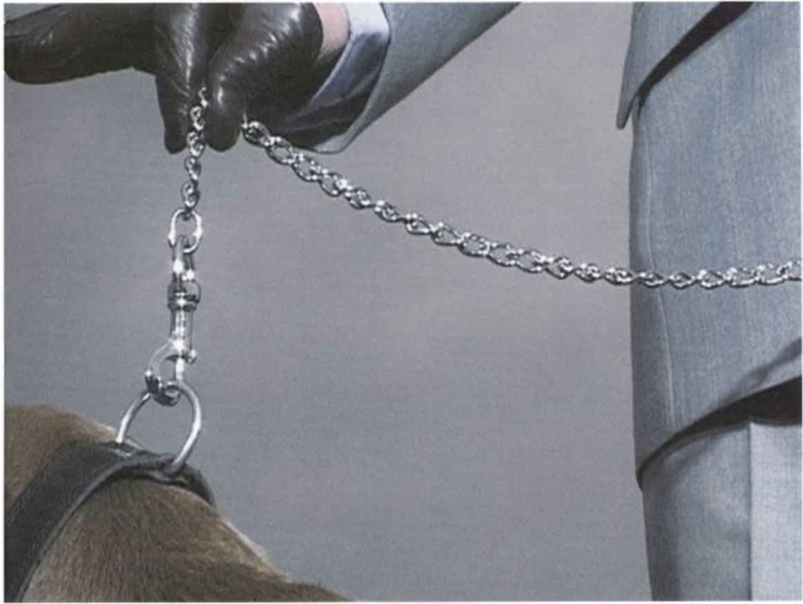
• Dog 2022 - Video 001