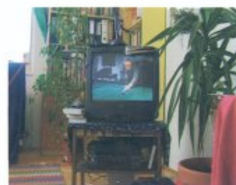
• Left to right: Link views in Glasgow, UK, Vienna, Austria and London