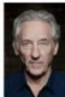
Ed Ruscha in London, 2010.