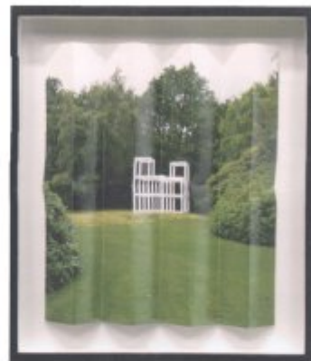
• Original (Dental) (Gol LeWitt)